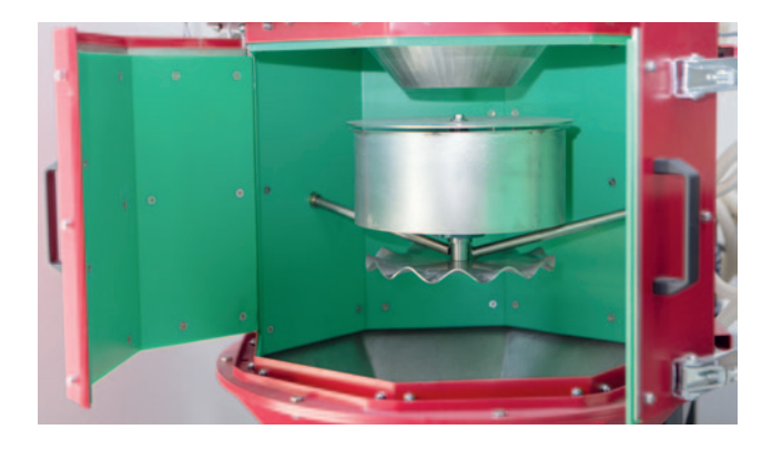
Interior of the spraying chamber

After applying the seed dressing, the product is transported to the secondary mixing unit where an even and uniform distribution on the seeds is ensured.